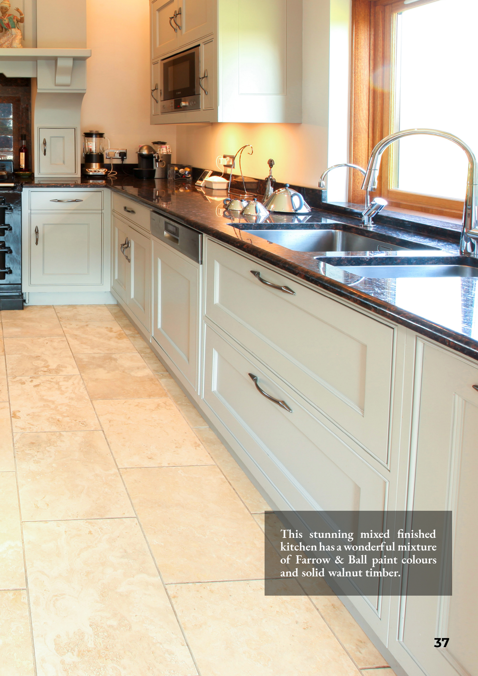
This stunning mixed finished kitchen has a wonderful mixture of Farrow & Ball paint colours and solid walnut timber.