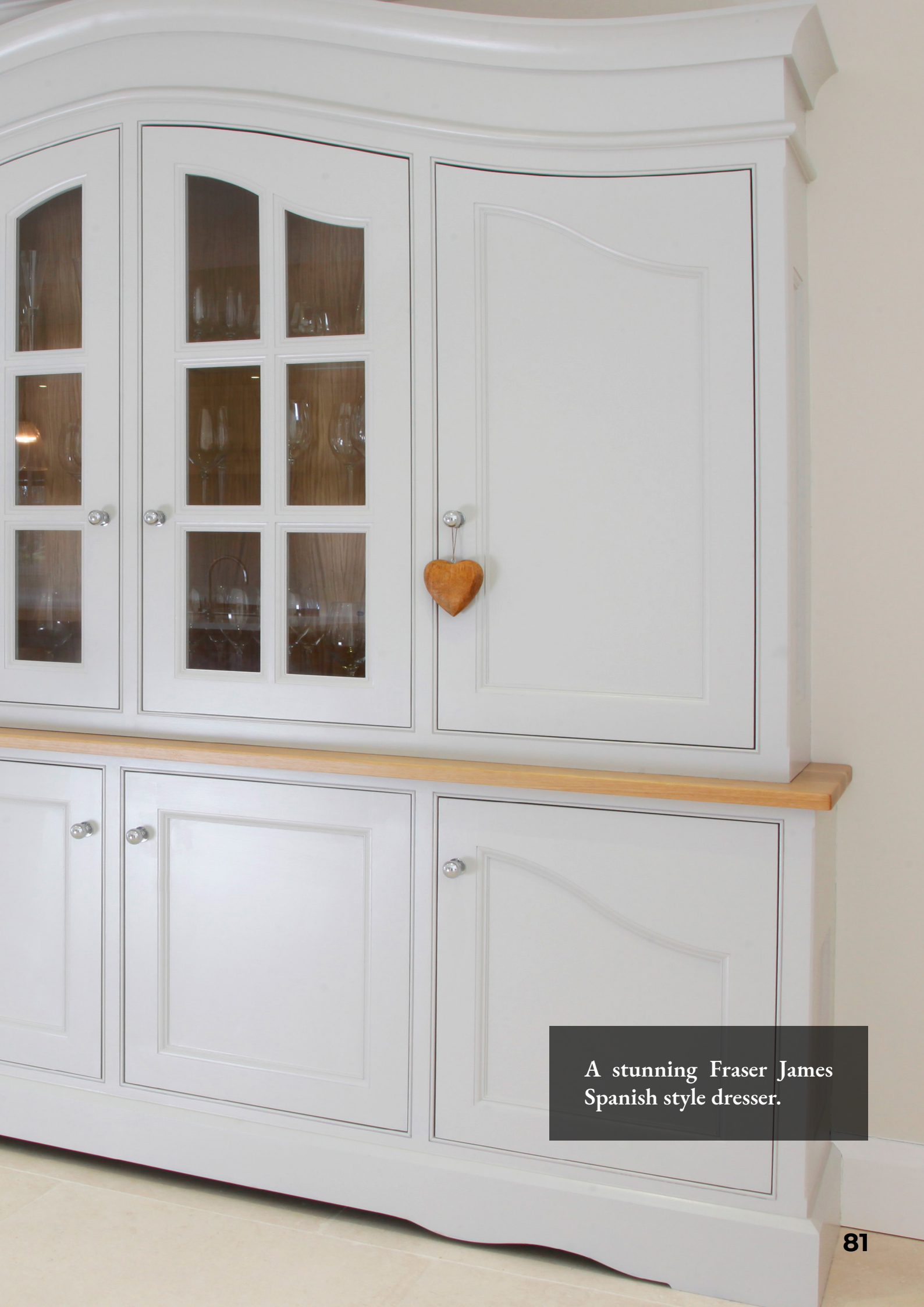
A stunning Fraser James Spanish style dresser.